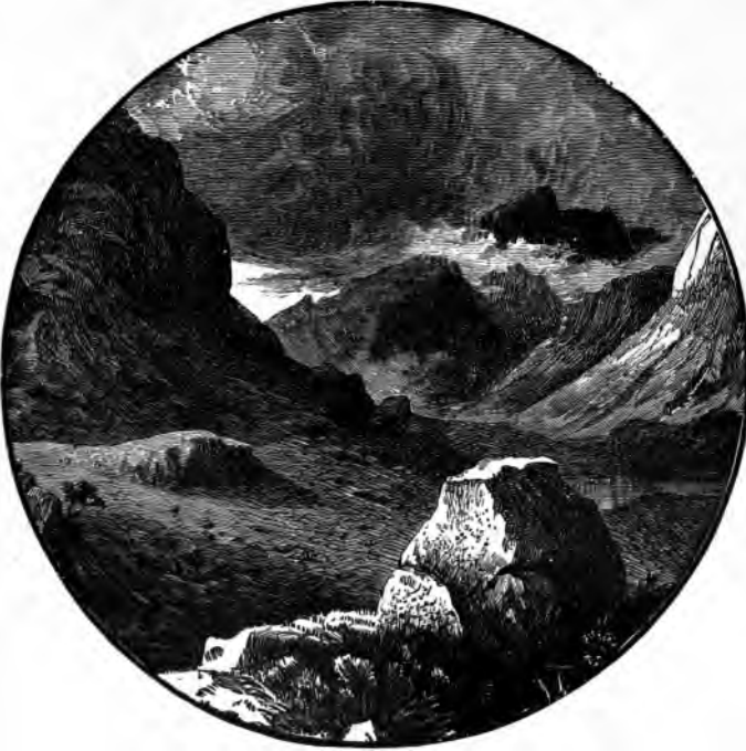
"The secret of the skies we keep." Page 262.